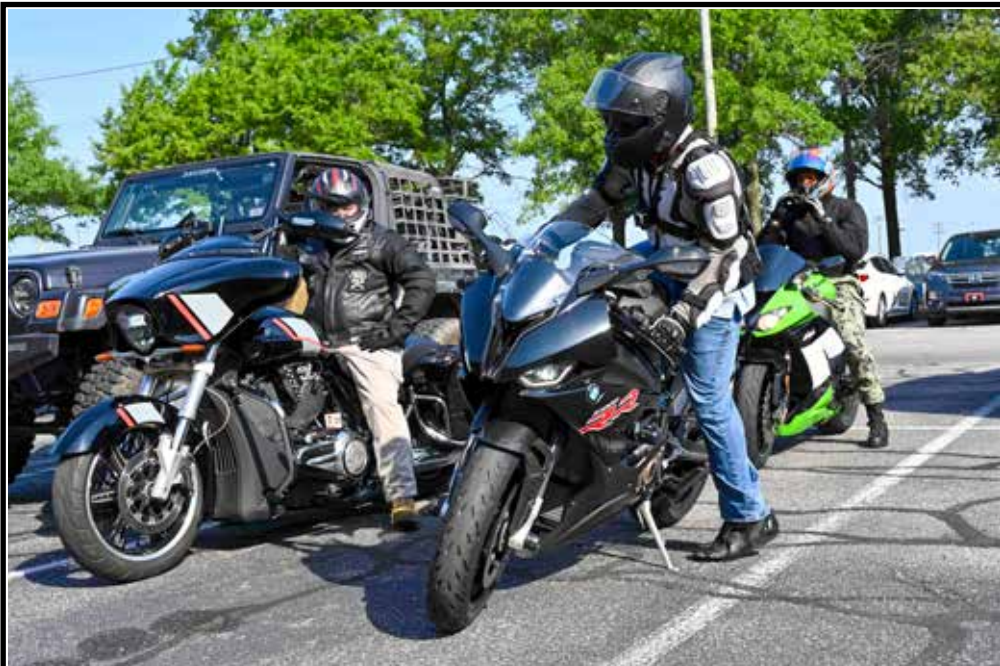
Sailors assigned to Naval Safety Command prepare for a command group ride, May 16. Motorcycle safety plays a critical role in the naval enterprise's commitment to reducing preventable fatalities and ensuring mission readiness.